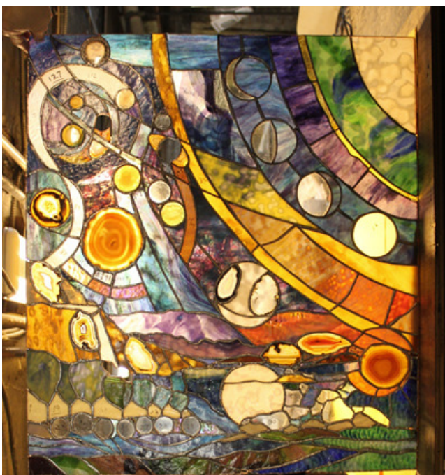
“Day 4 of Creation”